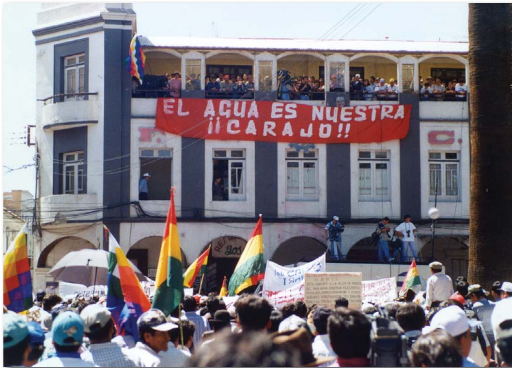
Residents of Cochabamba, Bolivia, celebrate after the Bechtel Corporation ceded ownership of municipal waters.

Elsewhere around the world, people and governments are fighting dams, water pollution, and other destructive development. Rather than allowing this development path to continue, they are protecting this precious ecological resource through alternative water management practices such as water conservation, ecological sanitation, reforestation, rainwater harvesting, water catchments and retention structures, and watershed protection.