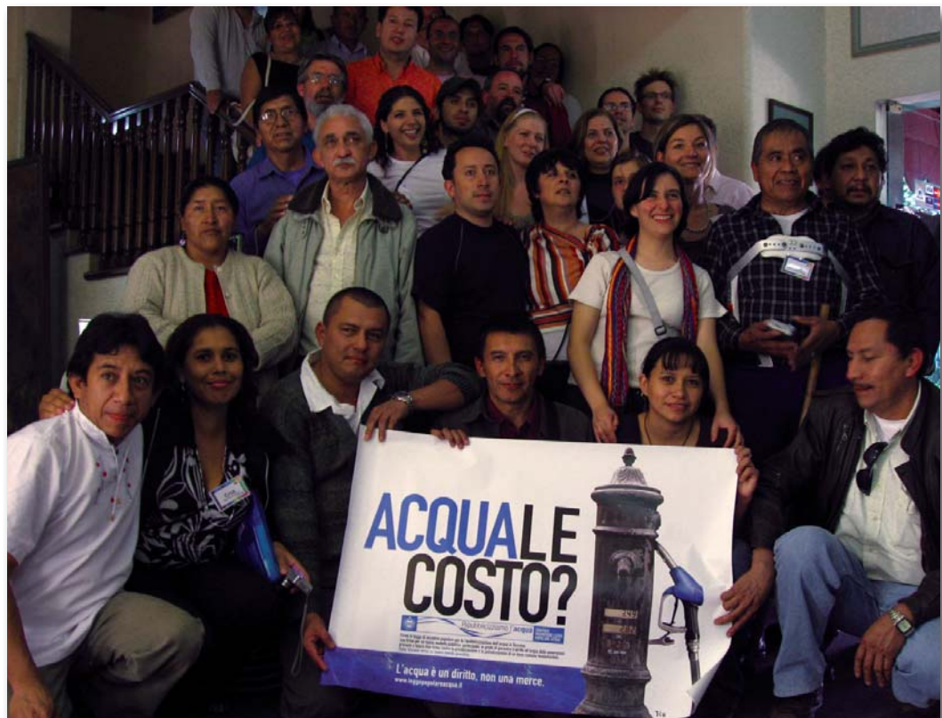
Participants of the Cochabamba gathering

In the face of diverse goals, challenges, and opportunities, and following on commitments made in prior years as social movements from across the planet, we struggle for the right to water with a holistic vision, according to the varying realities of every organisation, nation, culture, and people.